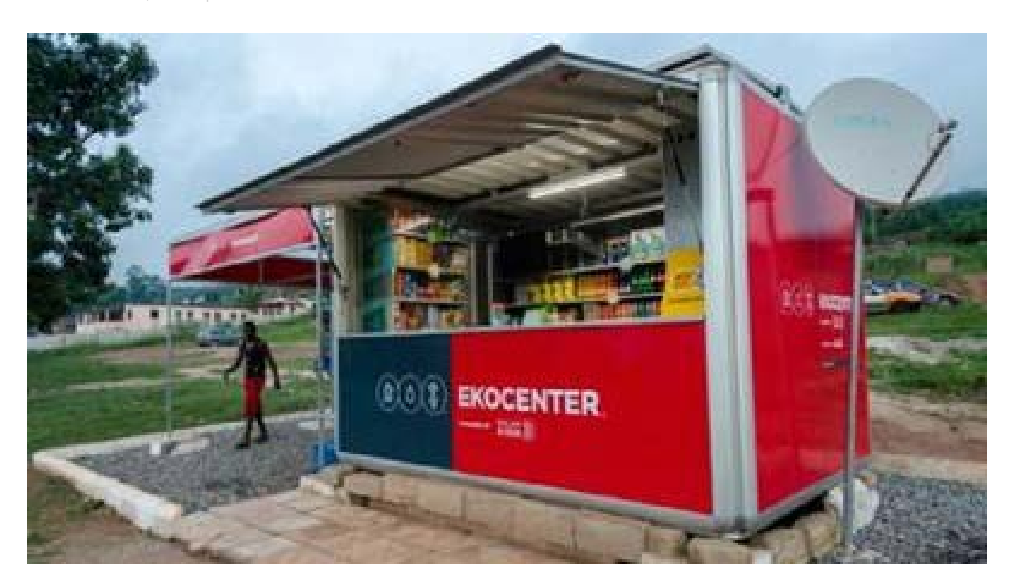
Coca-Cola's EKOCENTERS offer water purification and power outlets free of charge. They also sell Coke products.