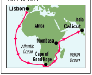
View Enlarged Image

Vasco da Gama's first round trip from Portugal to the subcontinent lasted from 1497 to 1499