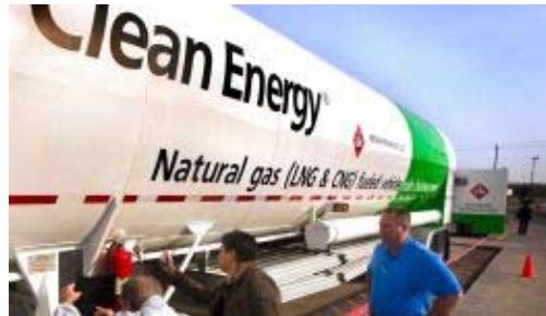
Natural gas vehicles receive little U.S. push