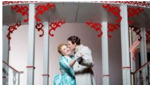
Hop aboard HGO's majestic 'Show Boat'