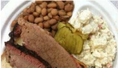
Students head to Camp Brisket